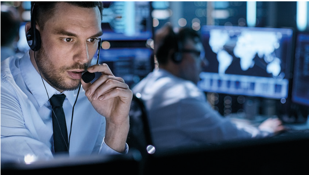
Figure 1 – Alarm Monitoring Centre