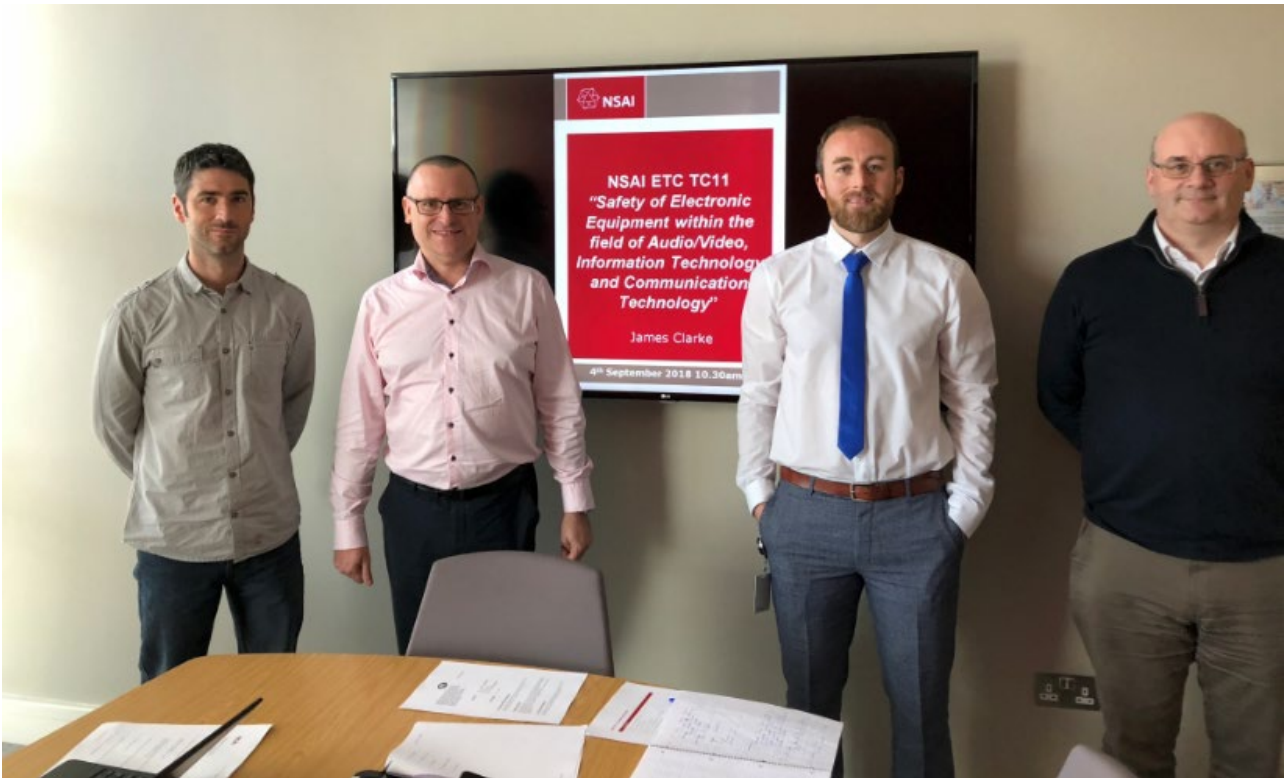
Photo of the NSAI ETC TC11 members at a meeting that took place on the 4 th of September 2018 in the NSAI, Santry.