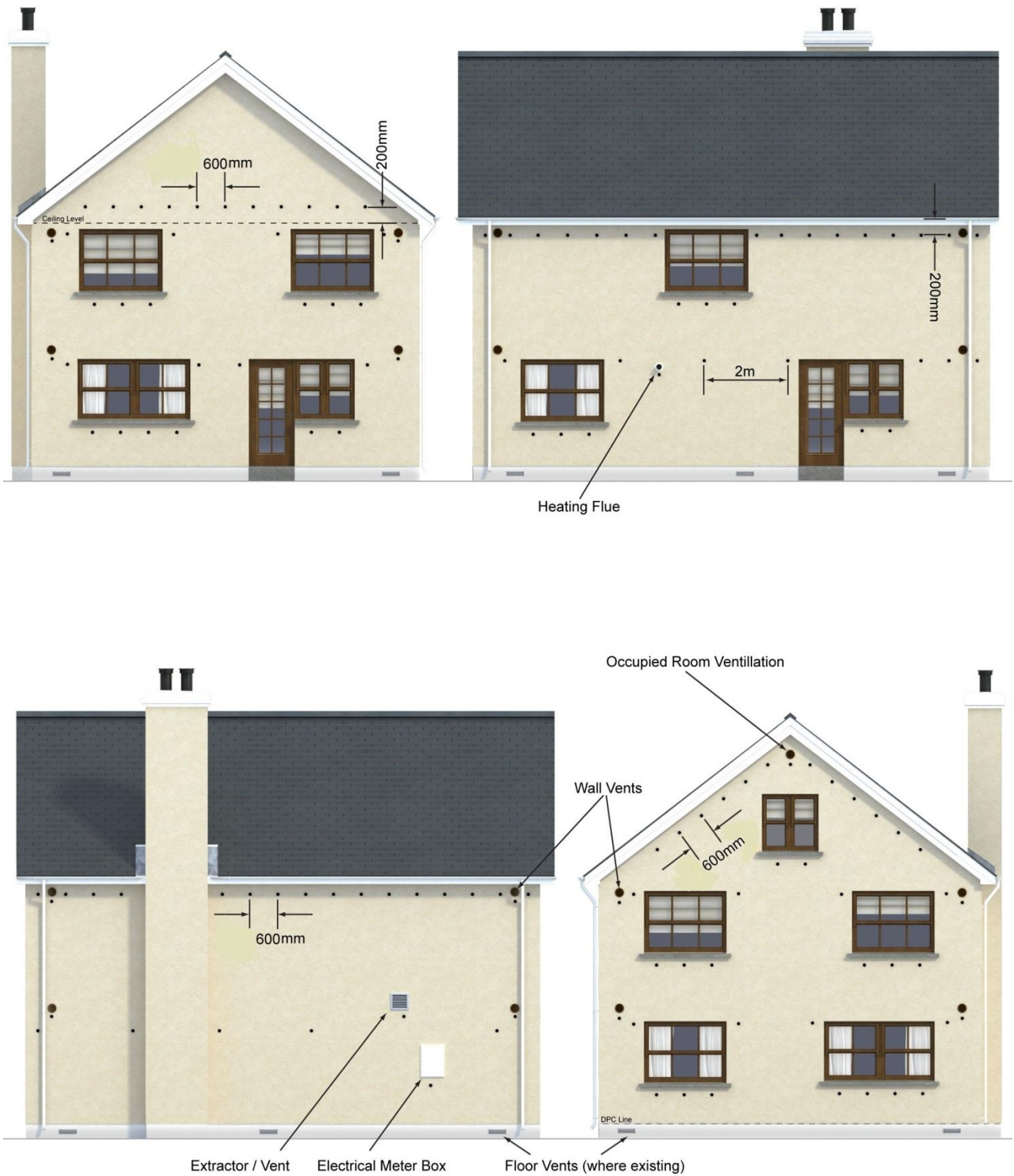
Figure 1: Typical Supertherm Platinum Hole Drilling Pattern in a Detached Dwelling. New and existing buildings without existing partial fill insulation in cavity.