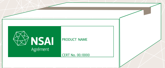
PACKAGING OF CERTIFIED PRODUCTS