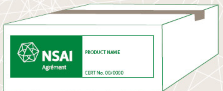
PACKAGING OF CERTIFIED PRODUCTS