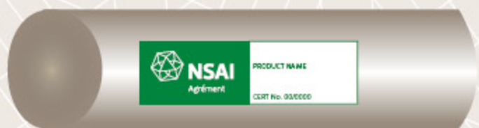
PIPES, EXTRUSIONS ETC.