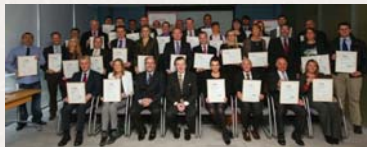
Certificate presentation – November 2013